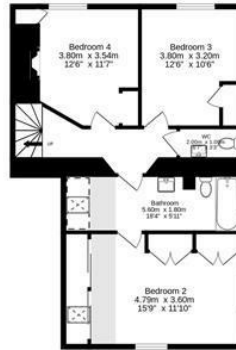
1st Floor 63.9 sq.m. (688 sq.ft.) approx.