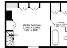
2nd Floor 35.4 sq.m. (381 sq.ft.) approx.